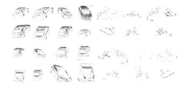
Figure 3. Examples of images for training, on the left are positive examples, on the right are negative

To train a classifier, it is necessary to assemble a set of negative examples - background images, and objects that should not be detected.