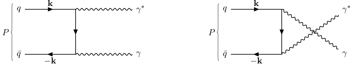
Figure 1. P(q\bar{q}) \rightarrow \gamma\gamma^* decay mechanism in proposed model.